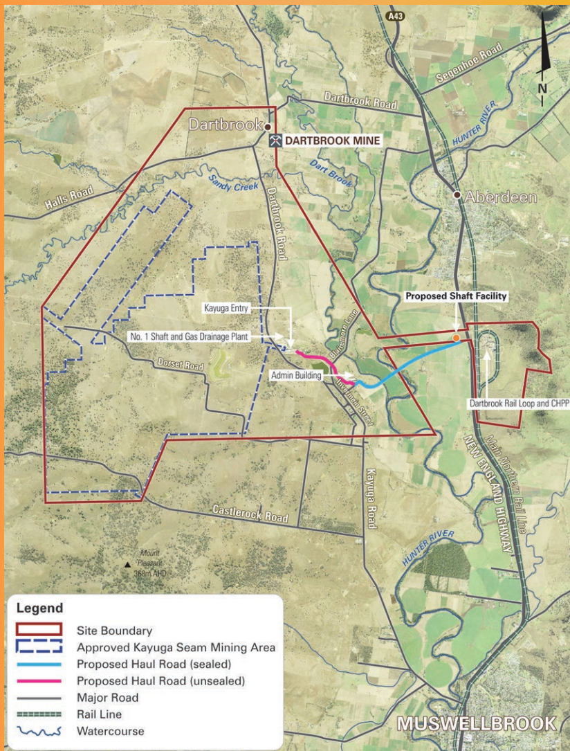
Figure 1 Conceptual Modification Layout