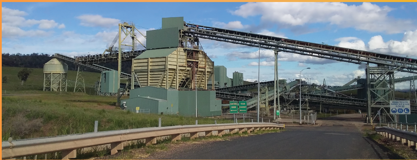
Dartbrook East Site Infrastructure, currently in Care and Maintenance.

It is hoped that a way forward can be found such that the very material social and economic benefits of the recommencement of limited underground mining at Dartbrook can be realised by the local community and the state of NSW.