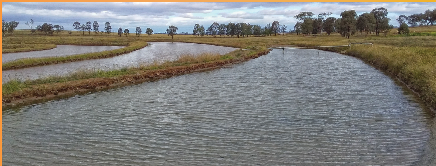
Dartbrook Evaporation Ponds.